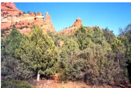
The front of Boynton Canyon (vortex at small knoll)