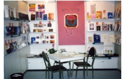
Booth at the Frankfurt Book Fair in Germany

New Editions has represented many local authors and musicians at the Frankfurt Book Fair in Germany , the largest book fair in the world. James Redfield's book Celestine Prophecy was first presented to international publishers by New Editions there. NEI was co-sponsor of the first US New Age trade show in 1996 and the International New Age Trade Show held in Denver in 1997. The company in West Sedona tracks the rapidly expanding New Age marketplace around the world.