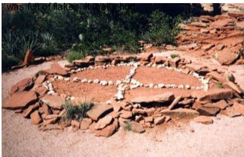
Medicine Wheel at privately owned Rachel's Knoll